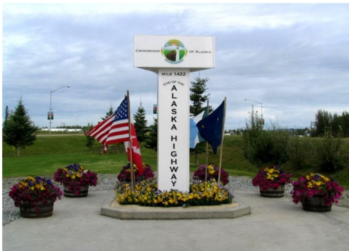
Mile 1422, End of the Alaska Highway! Visitors stop by for information, to pick up brochures, and to have their picture taken in front of the world famous Milepost!

VISITOR CENTER & SULLIVAN ROADHOUSE The Visitor Information Center and Sullivan Roadhouse Historical Museum are operated by the Delta Chamber of Commerce. Both are open for operation during the summer months.