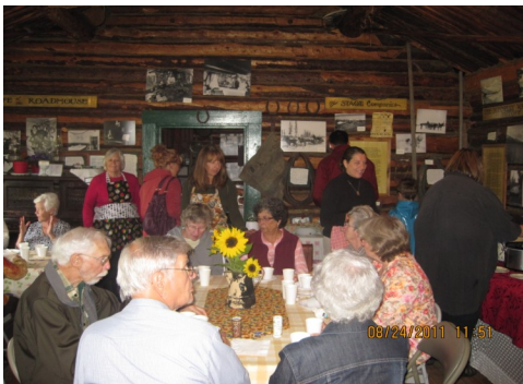
Membership Luncheons provide an opportune time to network with other business owners, along with hearing from business leaders around the state about what is working in their communities.

MISSION STATEMENT The Delta Chamber of Commerce is a business organization that supports and represents its membership by promoting business growth and community development through leadership, programs, education and the dissemination of information.