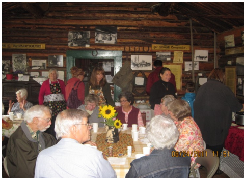
Membership Luncheons provide an opportune time to network with other business owners, along with hearing from business leaders around the state about what is working in their communities.

MISSION STATEMENT The Delta Chamber of Commerce is a business organization that supports and represents its membership by promoting business growth and community development through leadership, programs, education and the dissemination of information.